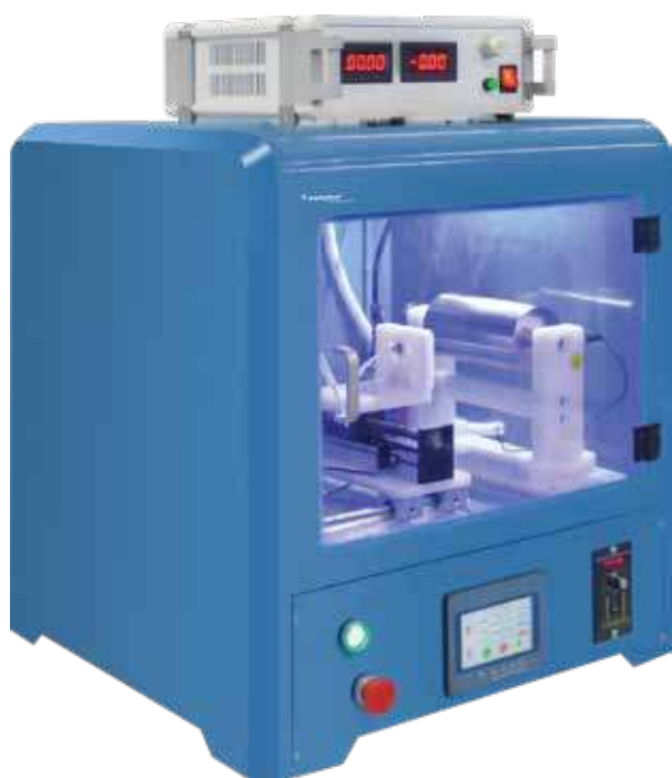
Professional Electrospinning Machine