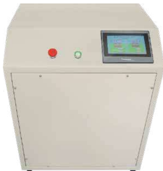
Electrospinning Humidity Controller

EPCC / PRODUCTS / APPLICATION / SOFTWARE / ACCESSORIES / CONSUMABLES / SERVICES